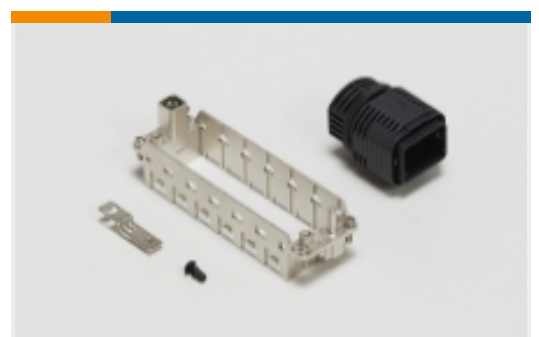
Rectangular Connector Hardware (13)