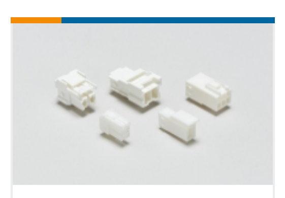
Rectangular Power Connectors(2)