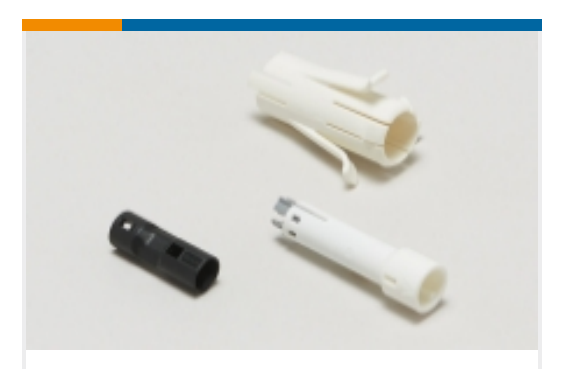
Plug & Socket Lighting Connector Accessories(1)